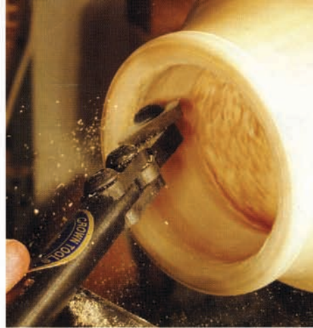
ABOVE: The heart scraper being used in shearing mode to clean up the surface