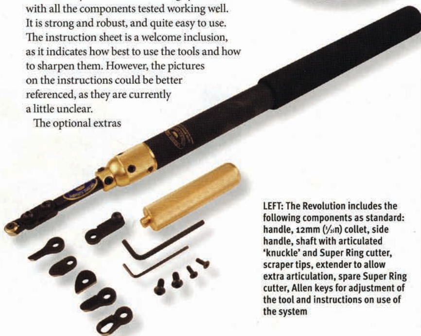
LEFT: The Revolution includes the following components as standard: handle, 12mm (1/2in) collet, side handle, shaft with articulated 'knuckle' and Super Ring cutter, scraper tips, extender to allow extra articulation, spare Super Ring cutter, Allen keys for adjustment of the tool and instructions on use of the system