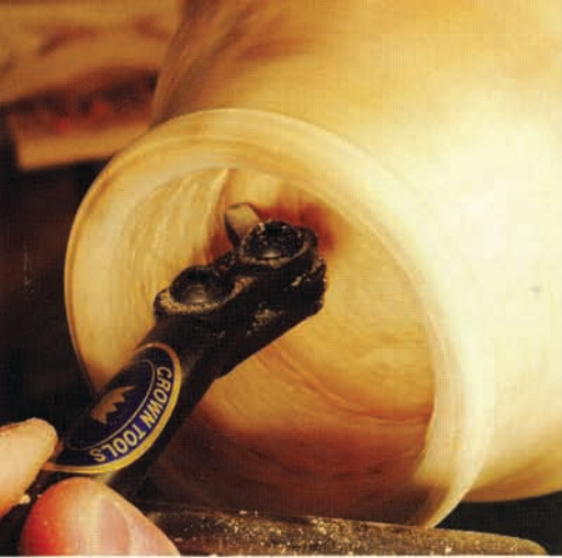
ABOVE: Key cutter being used to undercut the form